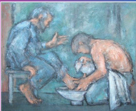
Ghislaine Howard - The Washing of the Feet

* denotes the display location for artwork from the Methodist Art Collection display on the Isle of Man ' Awakening ' www.methodist.org.im/awakening.html