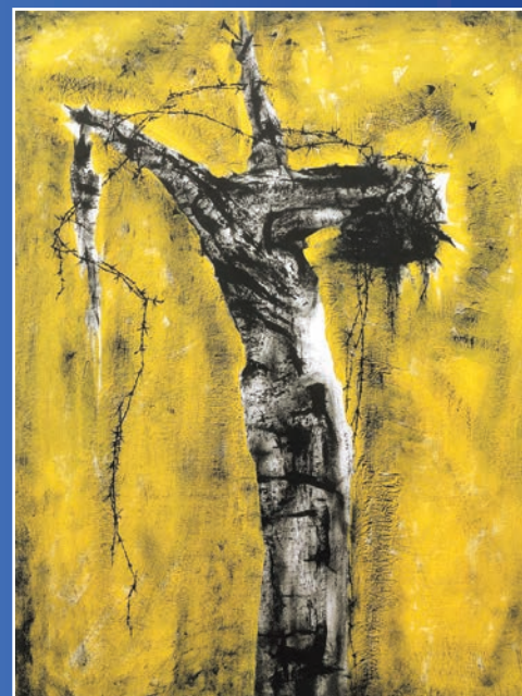
Theyre Lee-Elliott - Crucified tree form – the agony

Walking on footpaths and country roads. Wear stout footwear and clothing appropriate to the weather. Bring a packed lunch and drinks. (Circular walk distance 11.5 km / 7 miles; 4-5 hrs with lunch stop): opportunity to catch bus back to Rushen Abbey from King William's College. Please note that there will be racing on the Billown circuit this day.